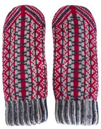
Source; The tale of Sven Öjbro house By A Elisabet Lindgren, Lycksele

Sven öjbros house / Various trading From "Joppes" was a short step to Sven öjbros timbered houses. The house with the rough timbers originally came from the village Ekorrsjö and was an inn / slid place, built in the early 1800s. Here was wayfarers, merchants, fishermen and hunters meetingplace on their way upstream or downstream from the ume River. When the mandatory markets during the autumn and winter in Lycksele occurred, it was crowded in the inn all rooms.