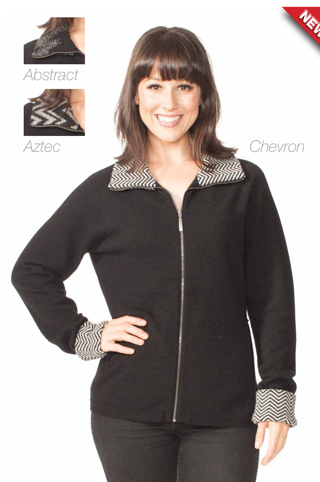
W753 Chevron Jacket