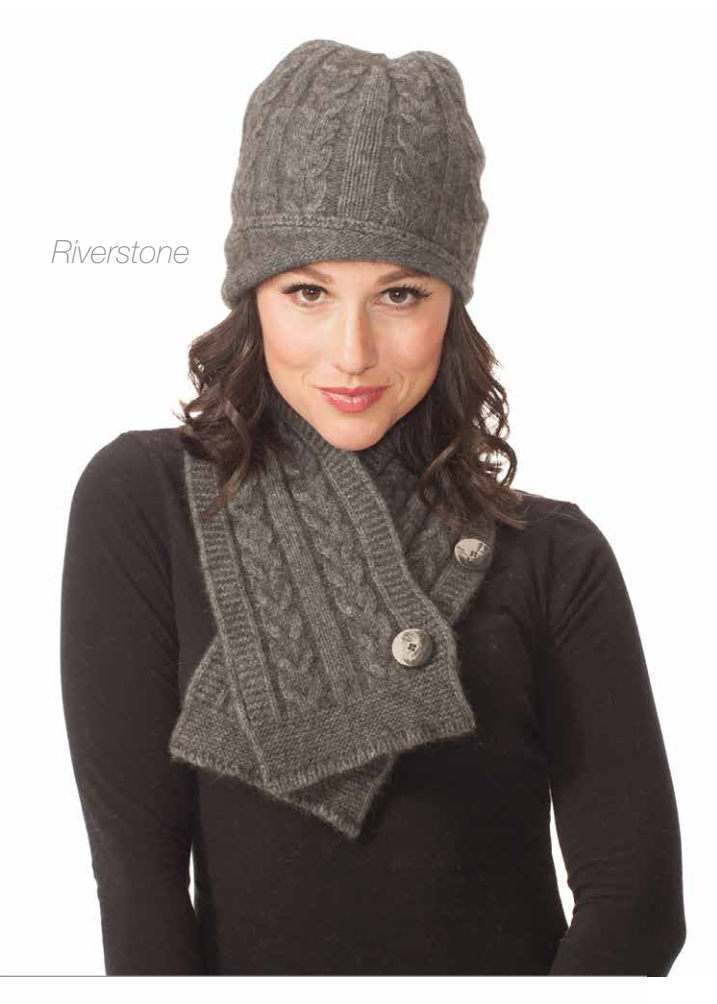
A714 Cable Beanie A715 Cable Button Scarf