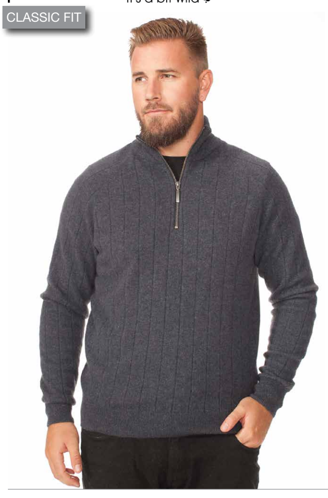
M390 Wide Rib Zip Collar Jumper S M L XL XXL - Denim

Every woman's favourite for her man to wear. Suits everyone.