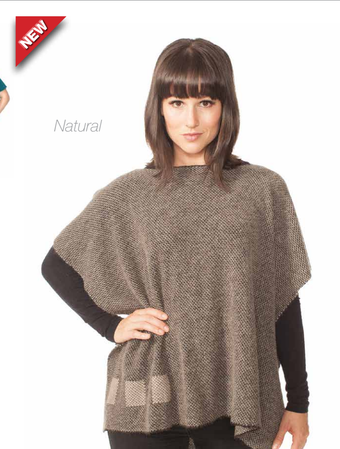
W758 Square Poncho