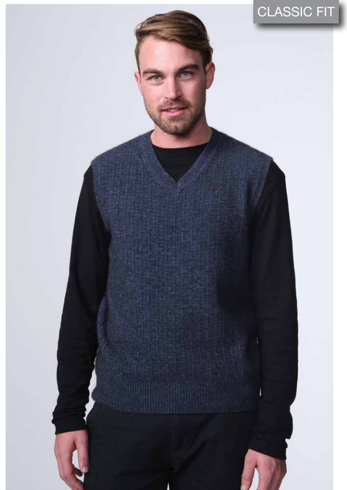
M380 Textured Vest S M L XL XXL - Aviator, Denim, Riverstone

A short sleeve version of the textured jumper. Wear it casual with a T shirt or under a suit jacket for style and warmth without bulk.