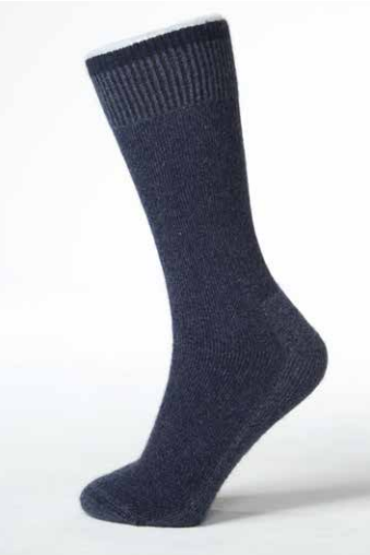
A500 Bushman's Friend

A230 Cabin Mate Sock SMLXL - Black, Denim, Natural, Ruby Toasty toes all week long. Thin enough to wear with dress shoes.