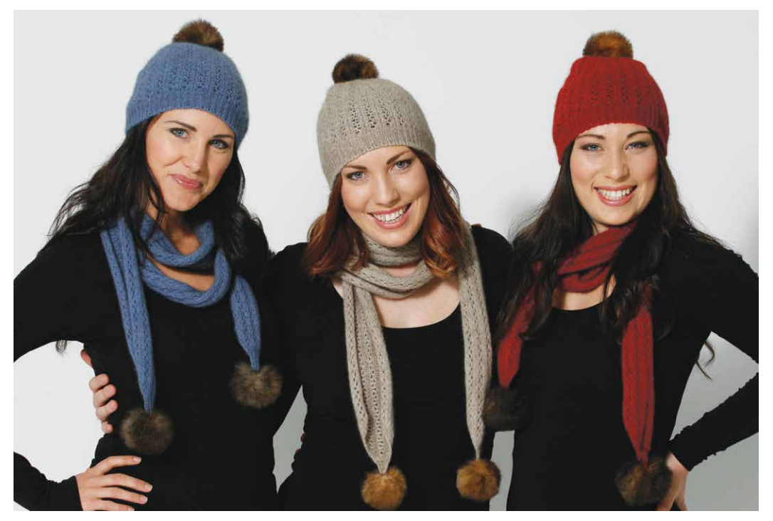
A423 Pom Pom Scarf A427 Pom Pom Beanie Aviator, Natural, Ruby

Luxurious natural possum fur pom poms or 'poi' adorn this feminine matching lace style beanie and scarf set.