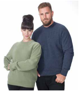
Flax - Denim