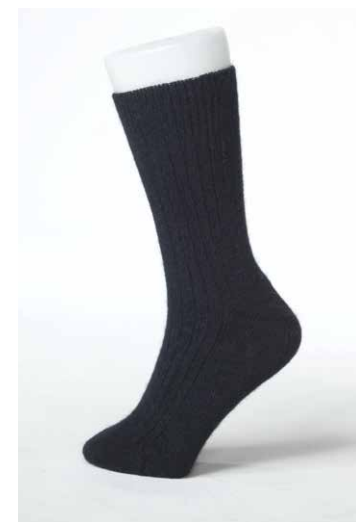
A230 Cabin Mate

Luxurious natural possum fur pom poms or 'poi' adorn this feminine matching lace style beanie and scarf set.